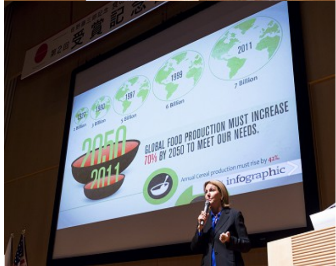
Ms. Josette Sheeran