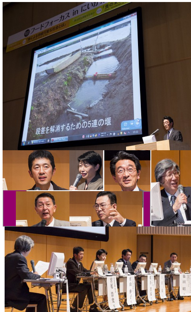
【Part Two】Foods of Niigata・Let’s Talk About the New Phoenix Society

Now the human society is in the term of paradigm shift. The sense of value is changing in many fields including food. The title of phoenix means FEENICS that indicates the each field of Food, Economy, Education, Nature, International, Care, Safety. We would better construct the New Model for local community to adapt the new value for every field. That will be the new way of thinking and life.