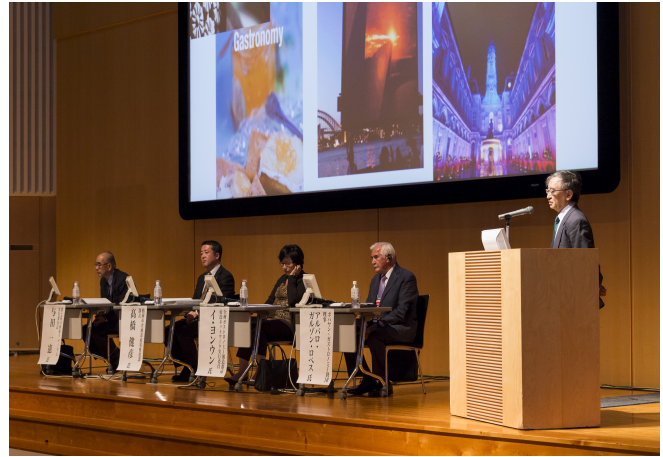
【Part One】Creative City Through Gastronomy

(And at the same place, “International Food Trade Fair” and “Flower Trade Fair” was held for 3days that is from 16 th to 18 th .)