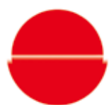
Rise field in Niigata

Niigata, a model city of food production increase and betterment The City of Niigata takes pleasure in commending people and community activities making outstanding contributions to the solution of world food problems.